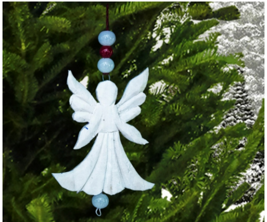
Christmas Ornament (Angel) 4" SH035