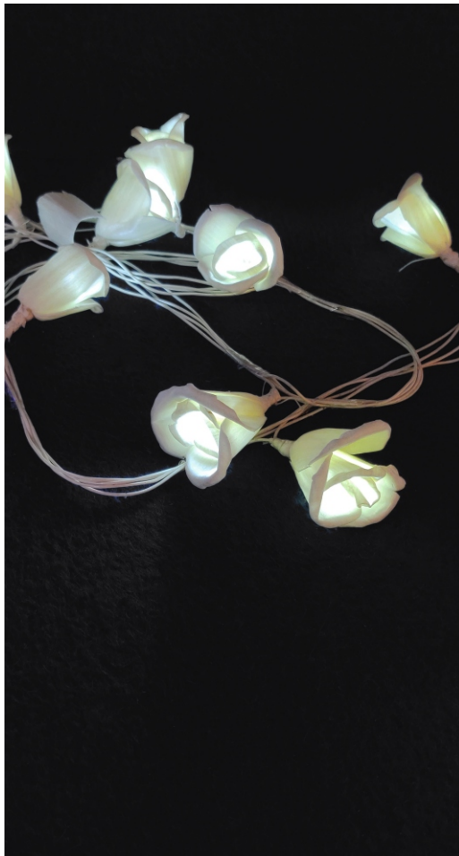
Rose Fairy Lights