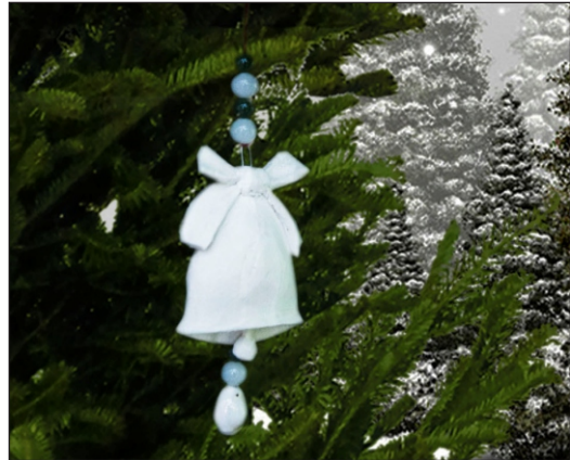
Christmas Ornament (Bell)

The Christmas decorations made of Shola are innovations which are developed. Shola is ecofriendly and pure white which sets the trend for White Christmas