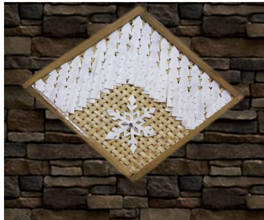
Christmas Clock 10''x10''