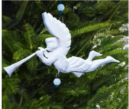
Christmas Ornament (Angel) 4" SH034