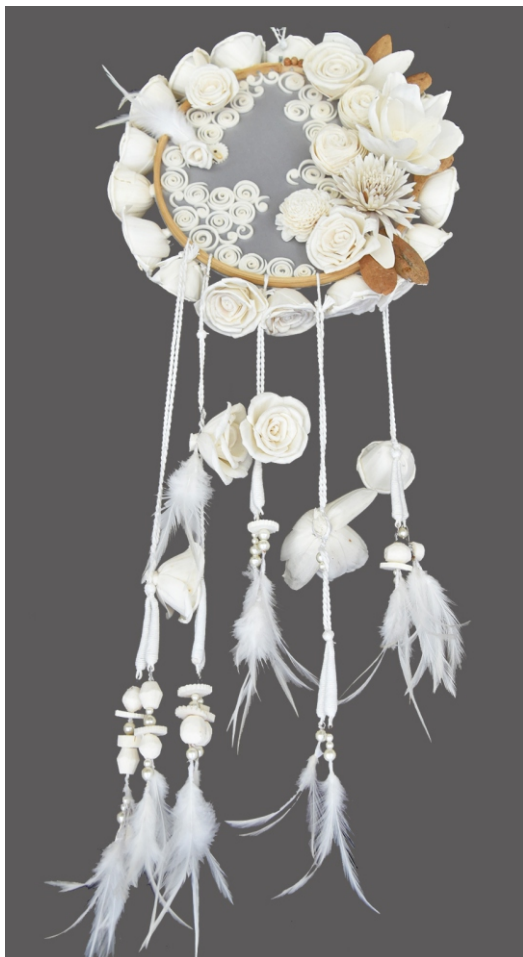
Rose Dreamcatcher 10'' dia