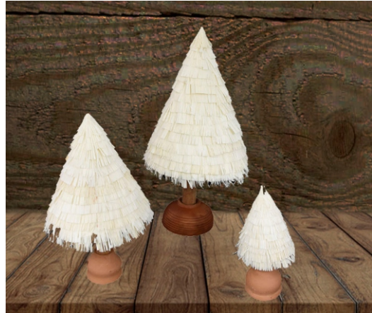
Christmas Tree 5'',8'',10''