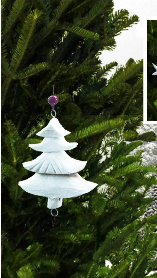
Christmas Ornament (Tree)