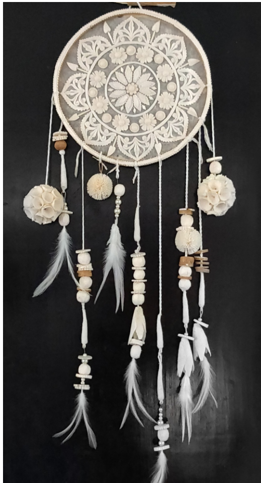
Mandala Dreamcatcher 10'' dia