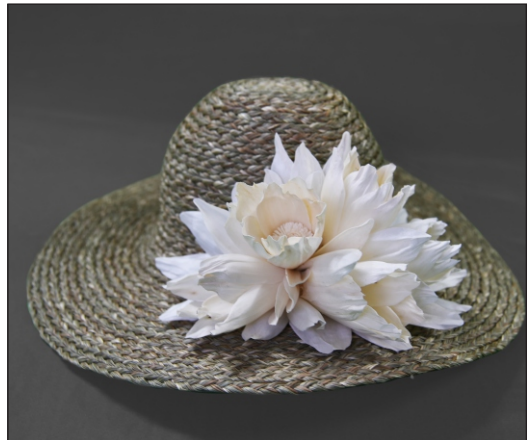
Sabai Shola Sun Hat