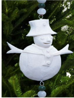
Christmas Ornament (Snowman)