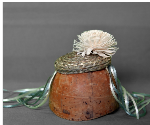
Sola Sabai Baret