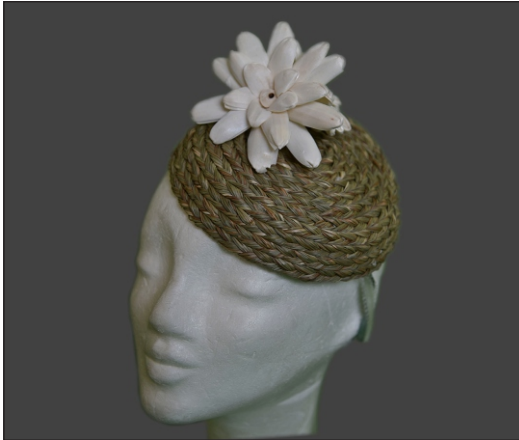
Sabai shola Baret