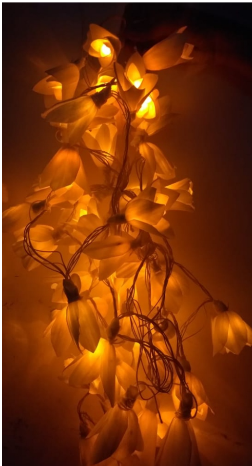
Tulip Fairy Lights