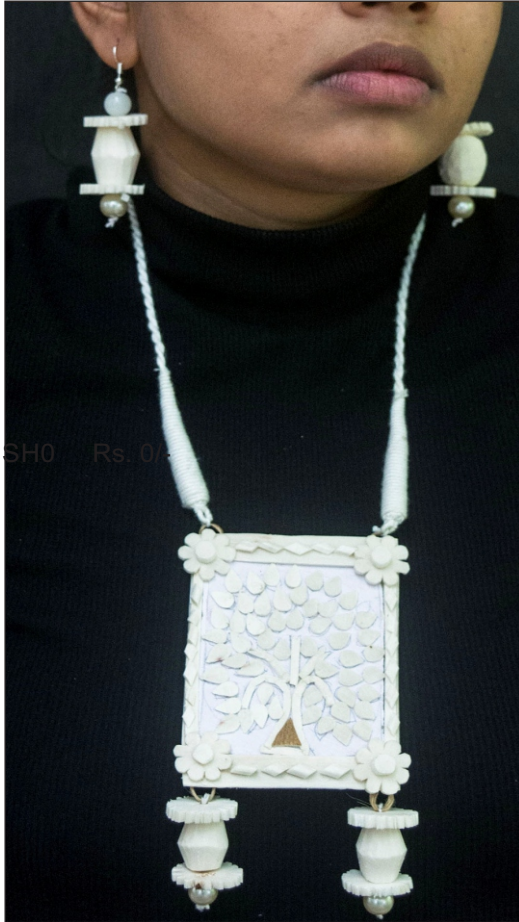
Tree Necklace Set