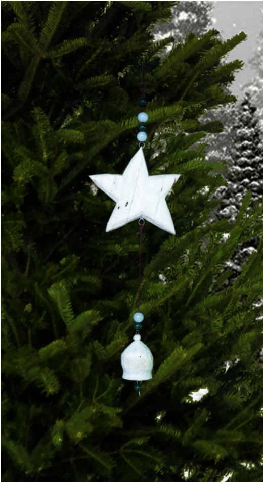
Christmas Ornament (Star) 4" SH033