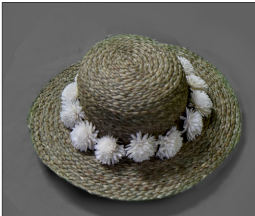
Sabai shola hat