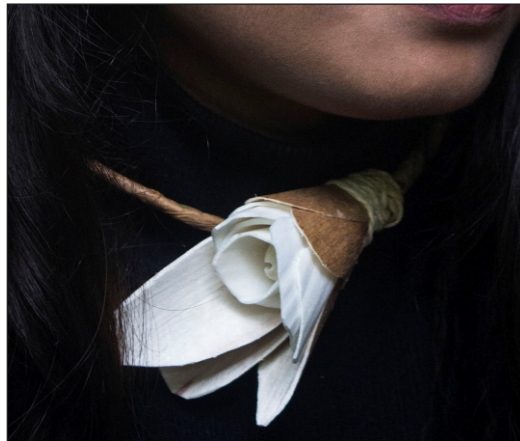
Rustic Rose Necklace