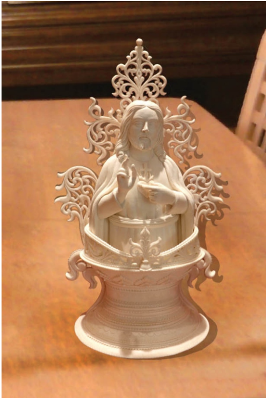
Jesus Statuette 10''L

Innovative decorations of Shola have been implemented in the lifestyle. Dream catchers, Lampshades and other home decorations make the range of products.